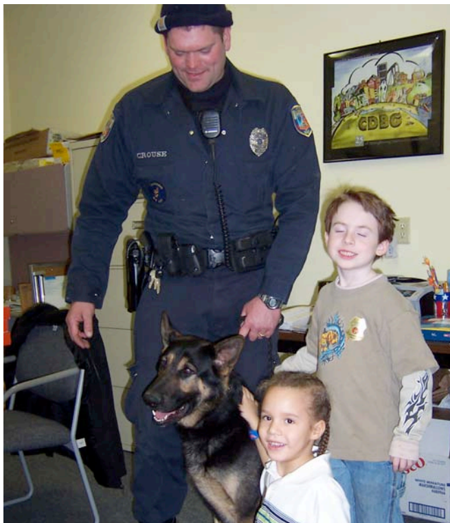
The Afterschool Program kids get a surprise visit from the K-9 unit.