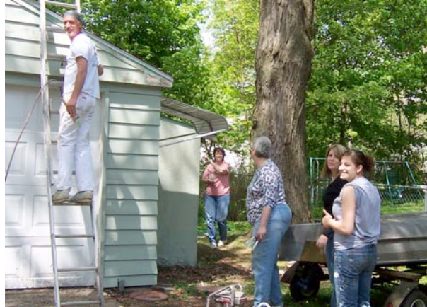
Building blocks residents from Site #3 on Adams Street work together to get some painting done on a neighbor's garage.