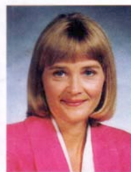
3514 S. Westnedge Kalamazoo, MI 49008