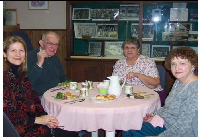
The first annual Oakwood tea party.

As we move forward in this time of social networking, ONA has made it easier to find what events are going on in the neighborhood. You can check out our web site, www.oakwoodneighborhood.org for a calendar of events and other information or become a fan of us on Facebook, just search for Oakwood Neighborhood Association or Oakwood Community Garden if you want to keep up with garden news.